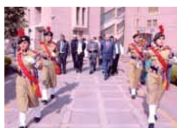
16-JAN- (1572) NCC-RDC-2012